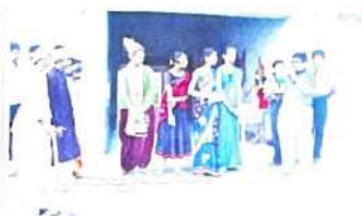
Drama on "Health Issues"