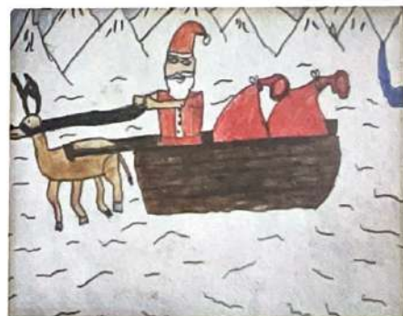
Tirth Chaudhari IV B