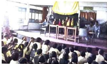
Puppet - show

Demonstration is a traditional classroom technique used to achieve objectives related to psychological and intellectual development of a child's brain. With this aim we demonstrated many life significant acts, manners and rules to our kids for their holistic development