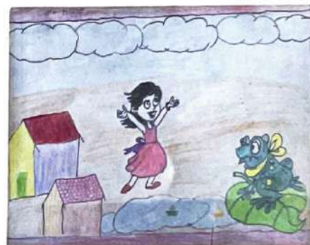
Bhagwati II A