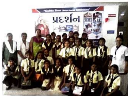
U.N. Mehta Hospital, Ahmedabad