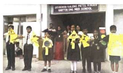
Traffic- signs and rules