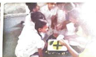
Making of Kit