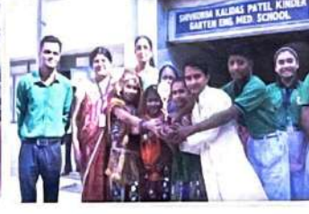
Doha - Recitation

"That some achieve great success, is proof to all that others can achieve it as well". -Abraham Lincoln