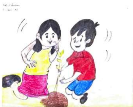
Hitansh Parmar III D